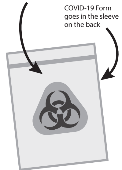
COVID-19 Form goes in the sleeve on the back